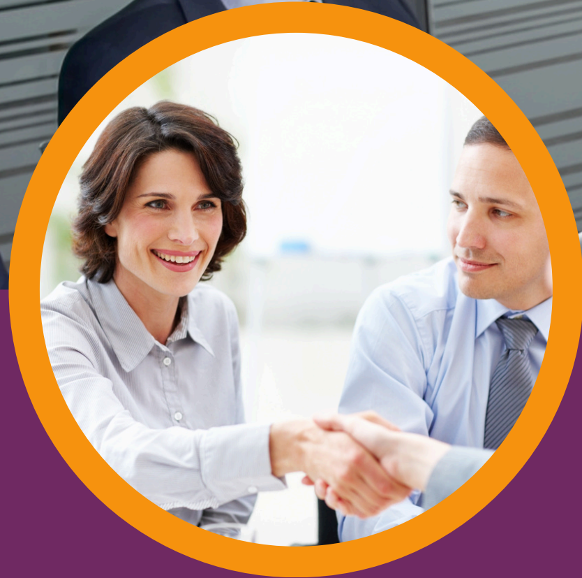
Clay Patra PRO