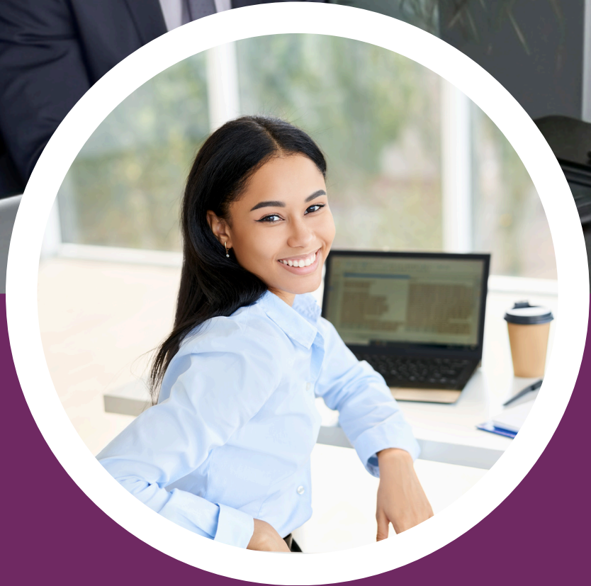
Bella Cullen Analyst